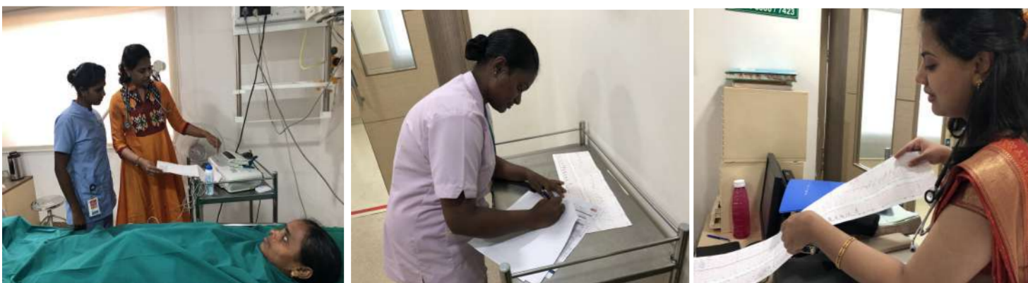
Live case Discussion